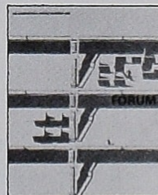
Cover: From a model photograph of George Gund Hall at the Harvard Graduate School of Design (p. 62).

THE ARCHITECTURAL FORUM Vol. 131 No. 5 December issue.